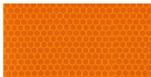
High Intensity Prismatic 1000 feet